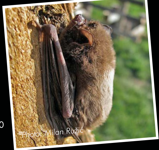
Common Noctu l e

Town of Kikinda is well known as the World Owl Capital. This unique site is a town square which hosts the larges Long-eared Owl roost of up to 750 birds! This phenomenon gathers thousands of visitors every winter who come to experience masses of owls, to take photos from a real close, but also to taste some local dishes and wines.