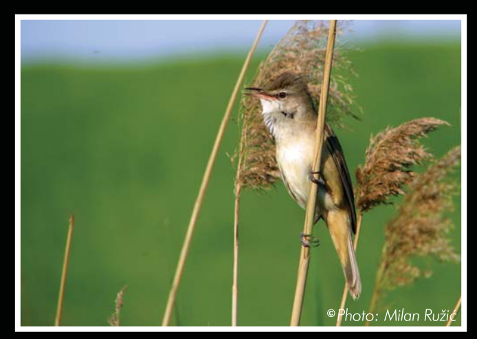
Great Reed Warbler

Birds include: Pygmy Cormorant, Black Stork, Great and Little Bittern, Great White Egret, Squacco Heron, Spoonbill, Ferruginous Duck, Garganey, White-tailed Eagle, Marsh Harrier, Water Rail, Corn and Little Crake, Whiskered and Black Tern, Lesser Spotted and Syrian Woodpecker, Wryneck, Red-backed Shrike, Penduline and Bearded Tit, Icterine, Great Reed, Marsh, River and Savi's Warbler.