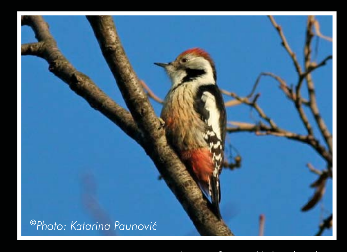
Lesser Spotted Woodpecker

Birds include: Black Stork, Little Bittern, Night Heron, Spoonbill, Ferruginous Duck, Red-crested Pochard, White-tailed and Lesser Spotted Eagle, Honey Buzzard, Black Kite, Marsh Harrier, Saker Falcon, Black, Syrian, Middle Spotted and Lesser Spotted Woodpecker, Turtle Dove, Yellow Wagtail, Collared Flycatcher, Red-backed Shrike, Great Reed, Savi's and River Warbler.